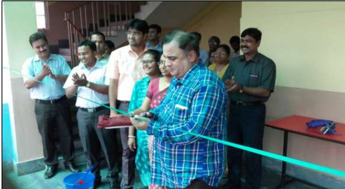
Inauguration of Hanging Garden by respected Principal sir