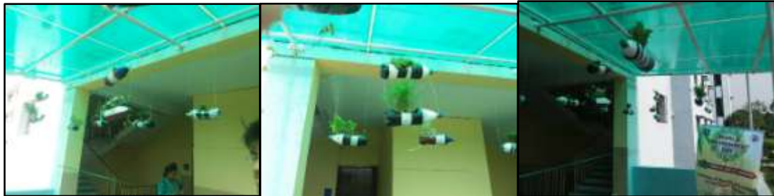
The Hanging Garden in-front of B.C.Roy Auditorium Hall