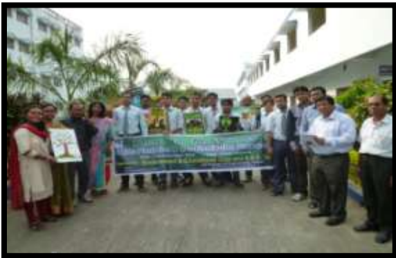
The entire team

A campaign was to raise awareness about the importance of greenery to save our planet a tree plantation and distribution event called – Plant for the Planet organized by our club in 2014. Trees were planted in the college campus and distributed to the passerby in order to raise awareness. As a promise for a greener world, thumb prints were taken from all the participants, instead of a regular signature campaign. This was done in the form of a tree to keep with the spirit of the event.