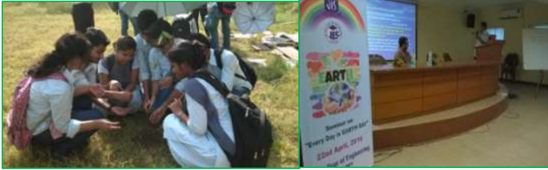
Tree plantation in JISCE campus